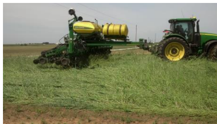
4. Soybeans planted on June 4 th , with a planter. Next time we will use a drill!