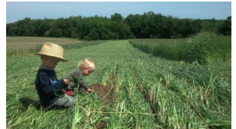
6. Emergence was ok.