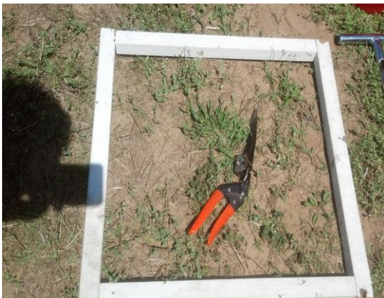
Tools used for Biomass Sampling