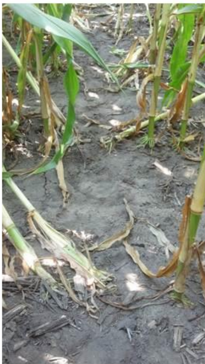
Corn down from one wheel on end row

Recommend lowering of combine head on turning end rows to maximize ears harvested.