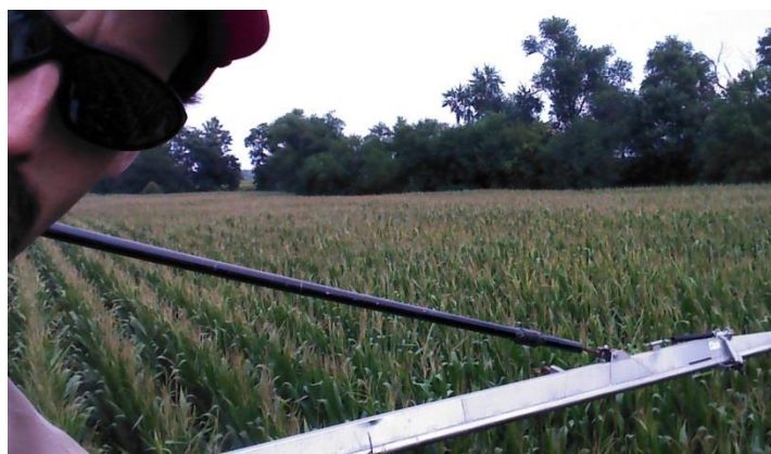
Boom height in 12 ft tall standing field corn

Click on link for video of the actual seeding: Does high clearance seeding of cover crop work in NW Indiana?