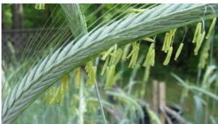
2. Cereal rye at pollen shed (>75% anthesis) = perfect for rolling to get 98% kill.