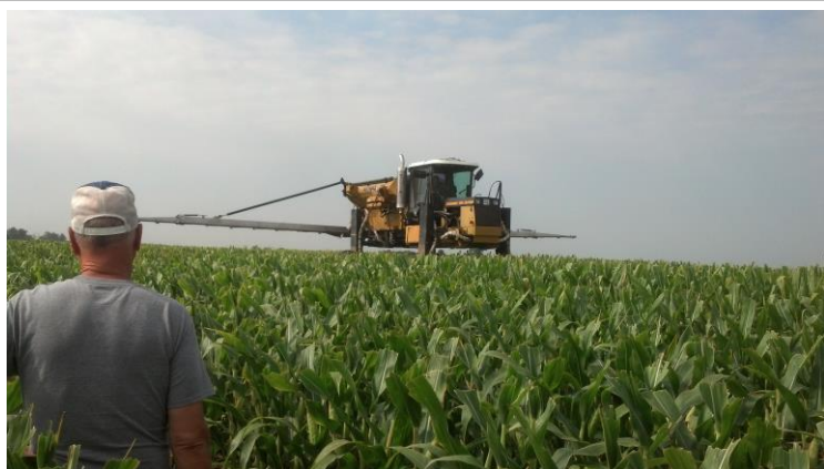
Seeding oats and radish into seed corn

New this year was seeding cover crop with a high clearance seeder. Uniform application and good stands were achieved, got the end rows and along tree lines! We also run through some 12 foot tall corn and calculated end row loss for your benefit.