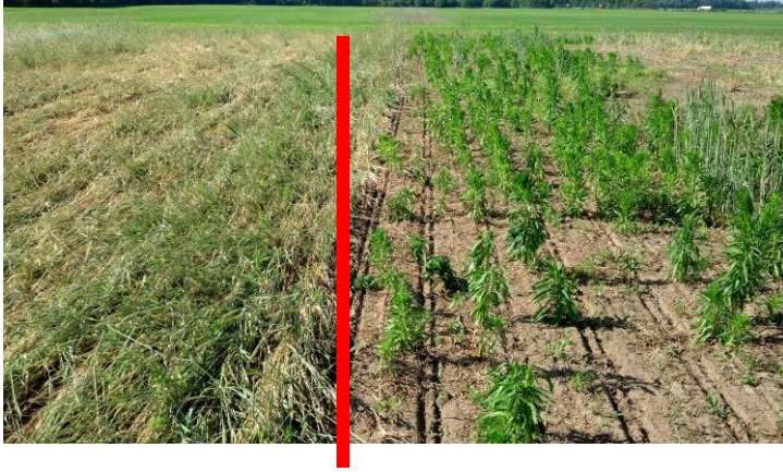
Photo at planting June 4th

8. The control with no cereal rye was weed filled and had poor emergence and stands.