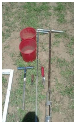
Tools used for Soil Sampling